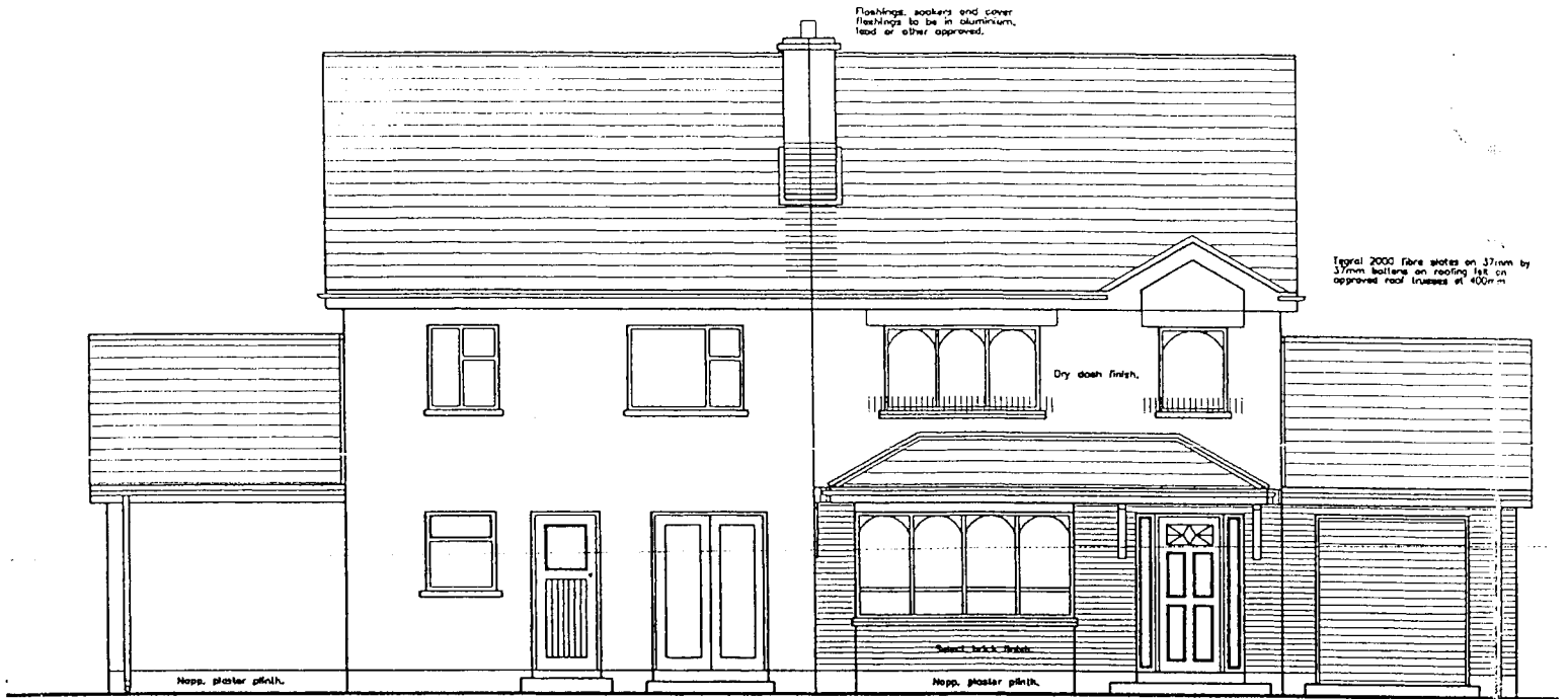
FRONT/REAR ELEVATION SCALE 1:50/100